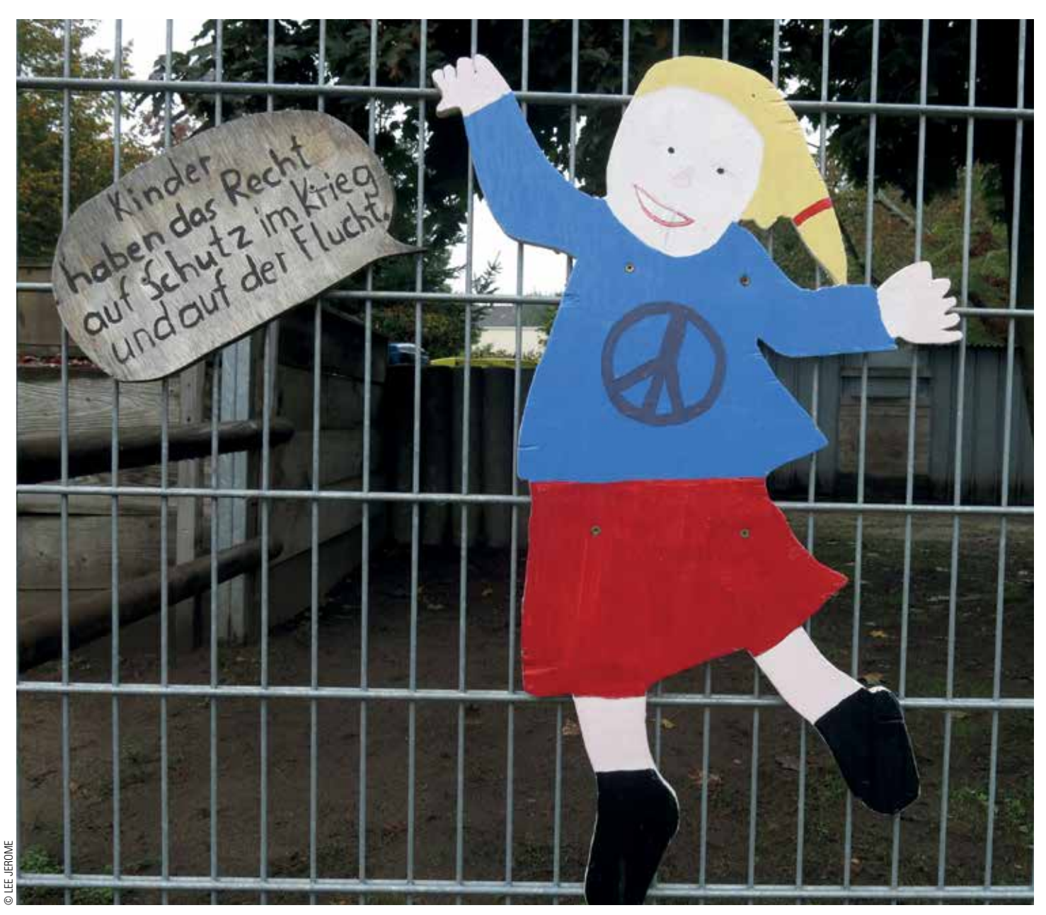
'Children have the right to protection in war and when fleeing [as refugees]', Albert-Schweitzer-Schule, Germany