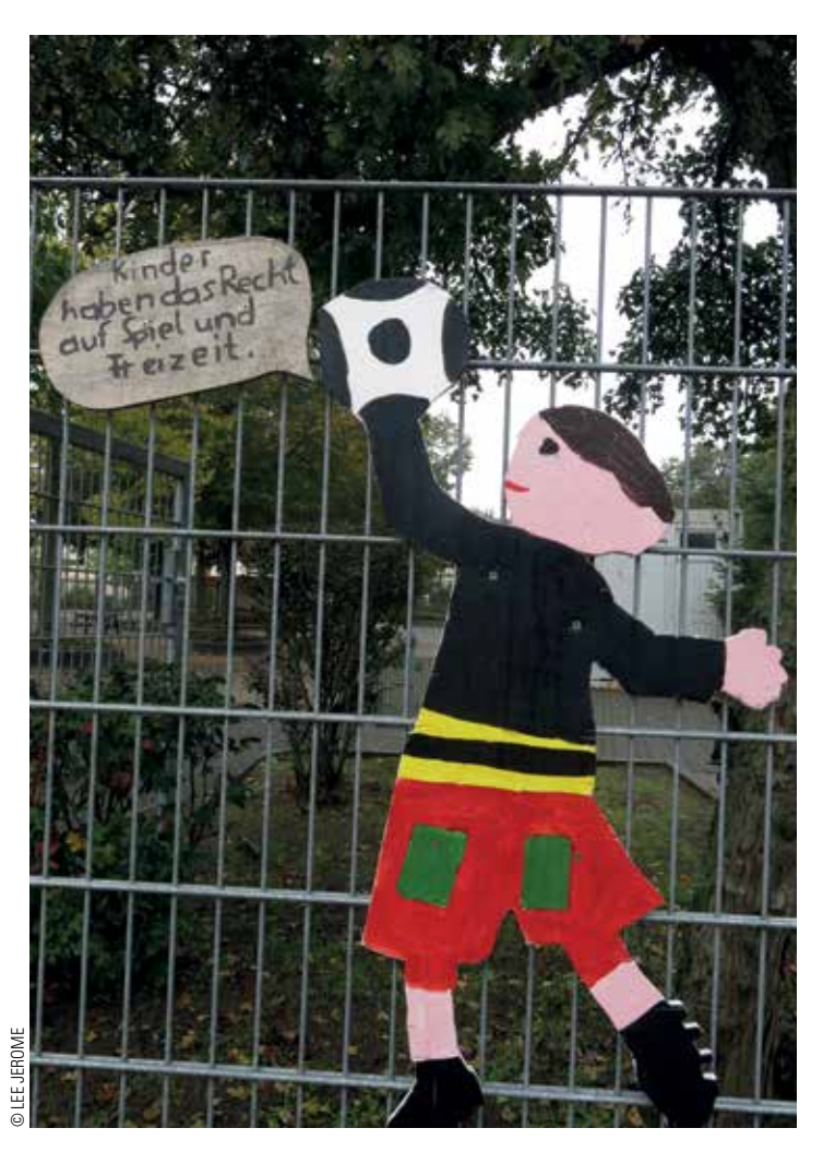
'Children have the right to play and leisure time' , Albert-Schweitzer-Schule, Germany

Having outlined some of the general issues emerging across the data, we turn now to provide brief summaries of each of the countries participating in this research.