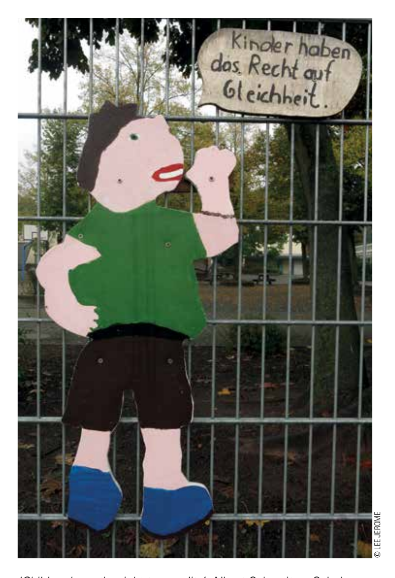
'Children have the right to equality', Albert-Schweitzer-Schule, Germany

Respondents were largely sceptical about the barriers to implementing human rights education, including lack of support for the CRC and a more general traditional of American 'exceptionalism'.